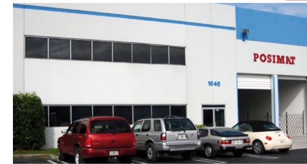
US facility in Miami