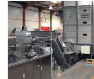
Complete Silo and Unscrambler installation