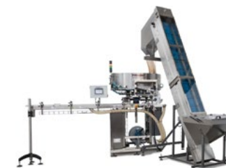
NEW POSICAP Cap Sorters