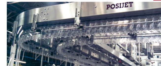
POSIJET air conveyor