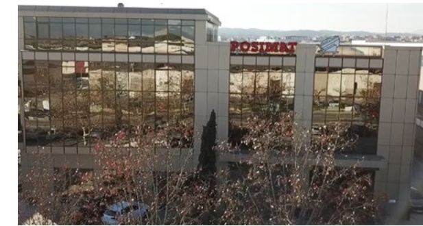
Headquarters offices in Barcelona

From these locations, the company provides not only the necessary equipment for plastic bottle handling, but also the overall engineering, from the blower to the filler.