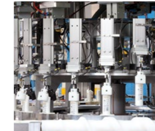
BTU (Bottle Transfer Unit)

(*) They can be installed integrally with the POSIMAT unscramblers or added later as a stand alone machine.